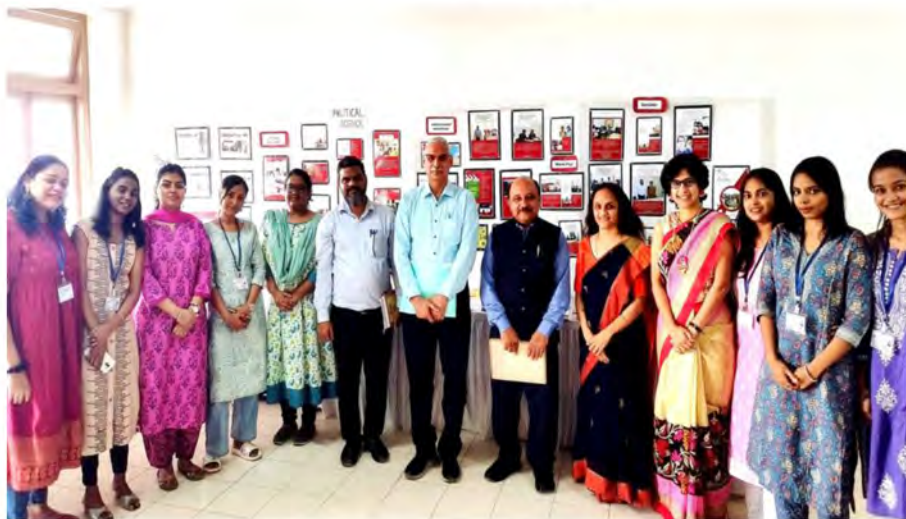
Students with Christophe Jafferlot and Salil Tripathi for a public lecture conducted by the dept in June 2022